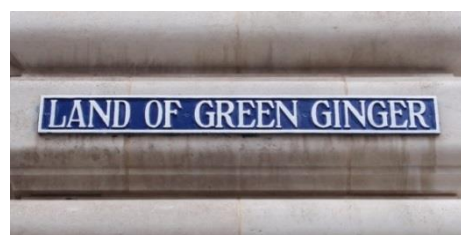
Old street name, Hull Old Town