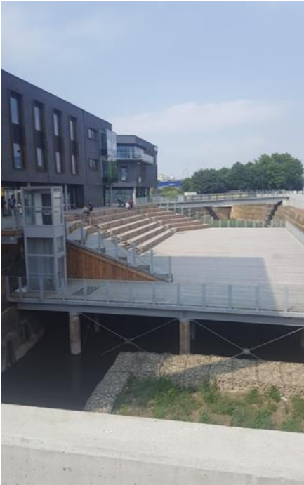
Reuse of disused dry dock (industrial archaeological asset)