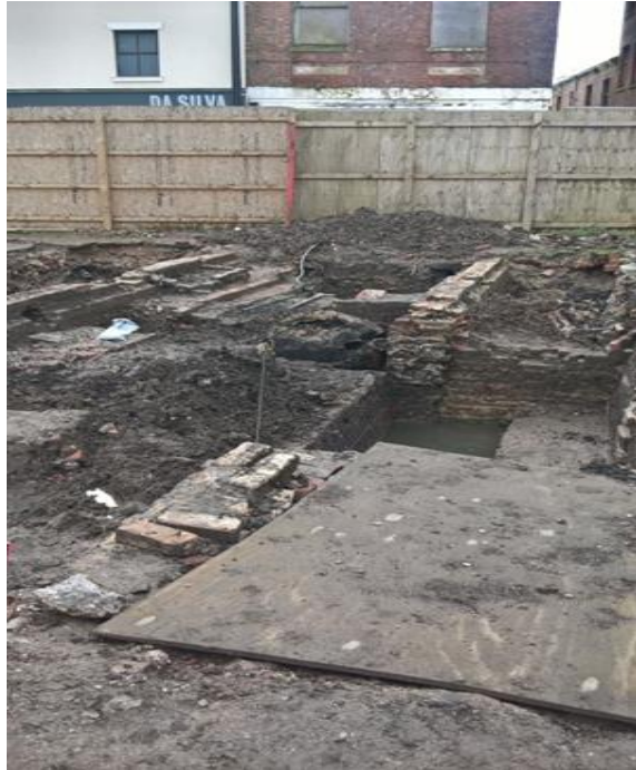
Archaeological excavation at Fruit Market, Hull

7.2 If archaeological features are present within the site area, (identified through archaeological evaluation, or known to survive), archaeological mitigation may be advised, as a condition on a planning application to secure the works.