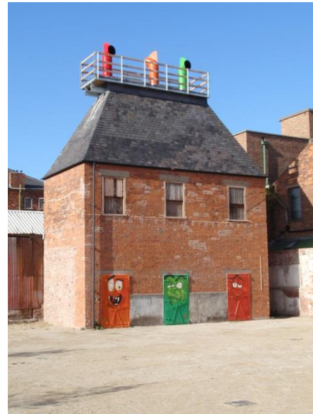
Bacon smoke- house (similar to fish smoke-houses), Wellington Street, circa 1930s

10.3 The town's whaling industry began in the late 16 th or early 17 th centuries when Hull seamen developed the Trinity Island whale fishery, but it gained a new lease of life in the 1760s when Hull boats began to exploit the whaling grounds off Greenland. Hull became one of the largest whaling ports in Britain – with the peak of its growth occurring between 1815 and 1825. The Greenland waters were massively over-fished, and after 1822 the trade shifted to new grounds off the Davis Strait; a little over a decade later, these too had been over-exploited, and there were too few whales left to support the industry, which rapidly declined.