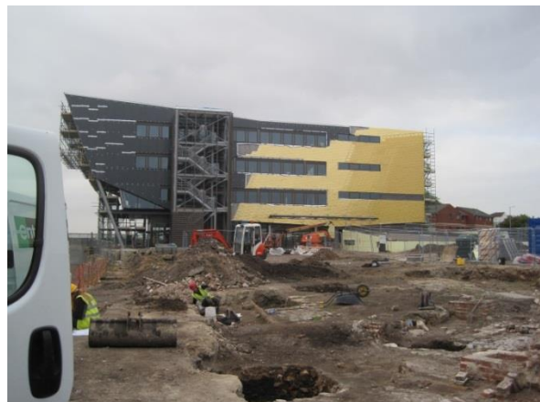
Archaeological excavation being undertaken in advance of construction, C4Di, Hull