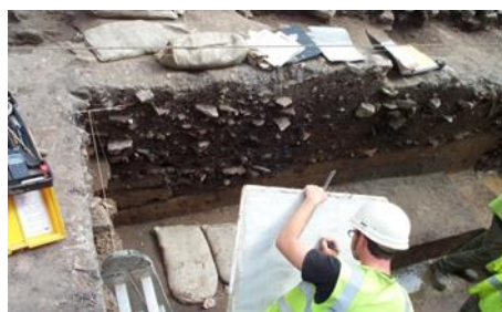
Archaeological recording of medieval deposits

6.2 An initial appraisal of potential development sites or works to historic buildings is made by the Development Management Archaeologist. In many cases development proposals will be too small to have any significant archaeological implications, although in certain areas even small-scale works can reveal important archaeological information. If the site is deemed to have potential for archaeological remains to be present, some of the following techniques may be advised.