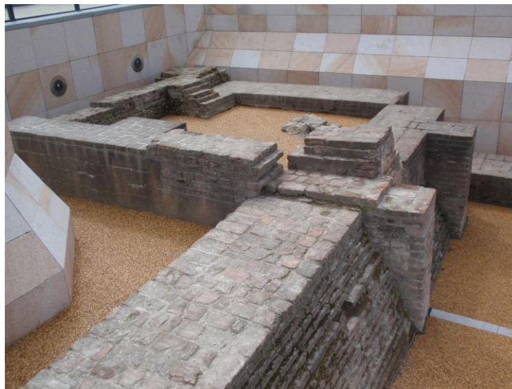
Remains of Beverley Gate and town wall on display, Hull city centre

3.3 The following heritage assets (designated under the relevant legislation) are World Heritage sites, Scheduled Monuments, Listed Buildings, Registered Parks and Gardens, Registered Battlefield, Protected Wreck site and Conservation Areas. Conservation Areas are designated at local authority level by Full Council and the former are designated at national level by the Secretary of State for Culture, Media & Sport on the advice and guidance of Historic England. Schedules of the nationally designated heritage assets can be viewed online via the National Heritage List for England at www.historicengland.org.uk . For Conservation Area boundaries and adopted Conservation Area character appraisals and management plans, these can be viewed on the Council's website ( www.hull.gov.uk ).