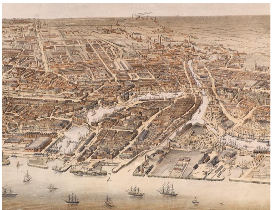
Bird's-eye view of Hull by Frank Pettingell, 1880