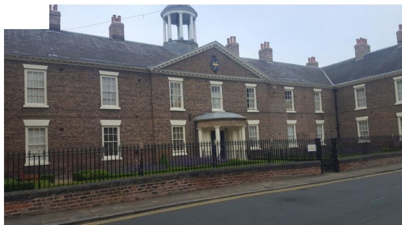
Hull Charterhouse, 1778-80